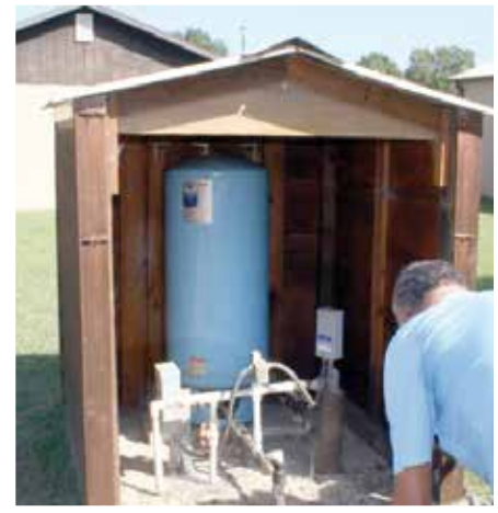
Home well water system