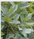
Plants and turf