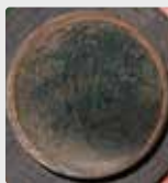
Biofilm in a piping system