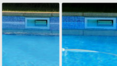
Swimming pool scale line