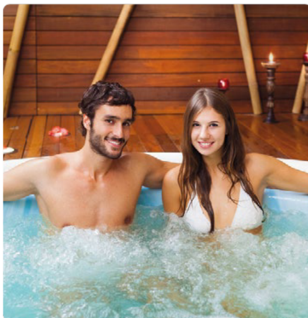
Hotel whirlpool in a wellness area