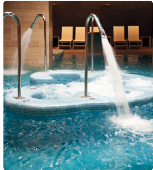
Thermal saltwater pool

Pools are half-open loop systems which suffer constant water loss as the pool water evaporates. The water demands constant maintenance and chemicals need to be added to keep bacteria, algae, and air quality in compliance with standards. Vulcan improves the water quality and with this the effectiveness of certain substances. Vulcan reduces the cleaning effort for the pool itself, the water line, for tiles, grids, floors and walls.