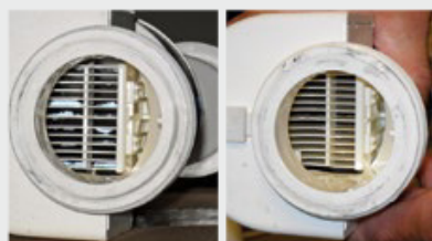
Swimming pool filter